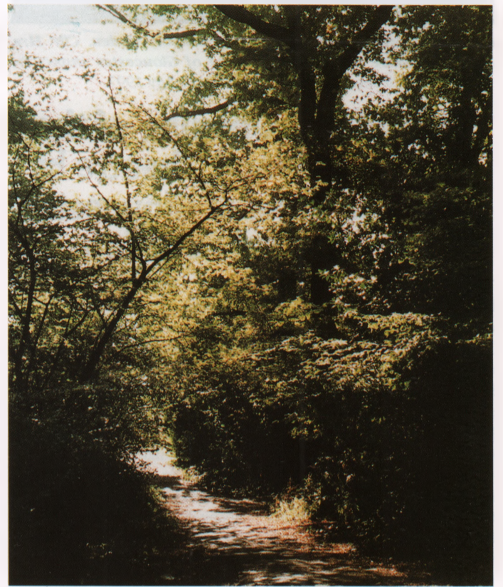
Above: Bigwood, the oaks are over 150 years old and not regenerating. Residents are invited to join in helping them to do so. See p3.