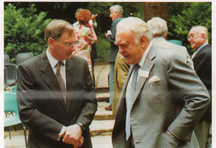
Above: Its not often that the Suburb gets into the Court Circular but it did on the day that HRH The Duke of Gloucester, seen here with Sir Donald Sinden, came to open the new Theatre in Little Wood. See p 2.