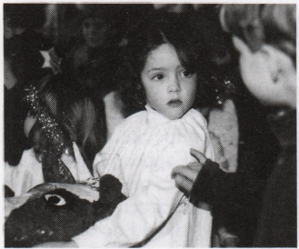
No I'm the cow