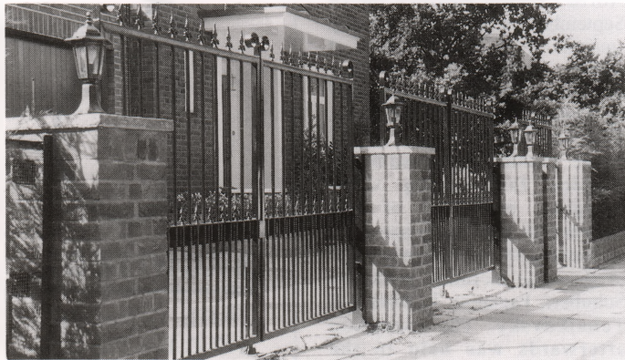
The Trust was about to exercise its legal right to have these gates, which had been put up without planning consent, removed, but before they could do so the house, in Linden Lea, was sold and the new owners agreed to take them down