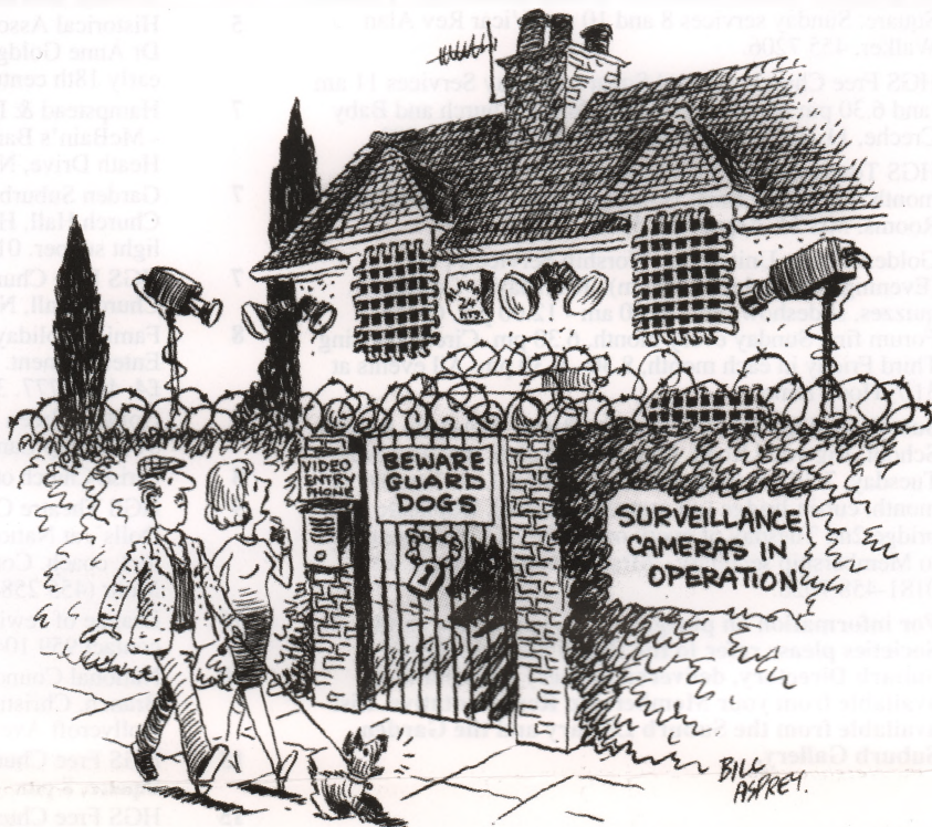
"I THINK THEY'RE READING TOO MUCH INTO THE SUBURB CRIME STATISTICS!"