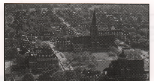
Aerial colour photographs of the area around Central Square are amongst a large range of cards available from the Garden Suburb Gallery.

GRIFFIN STONE, MOSCROP & CO Chartered Accountants Registered Auditors