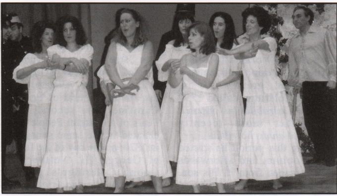
Chorus of workers from the cigarette factory