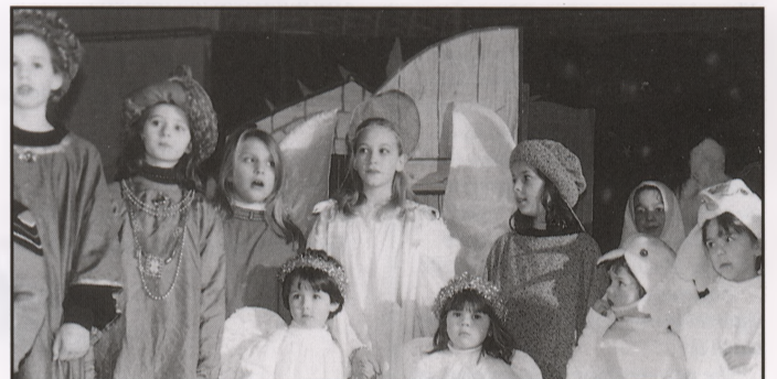
Other parts were played by members of the cast

First Floor Flat 9 Upper Belgrave Road Clifton, Bristol