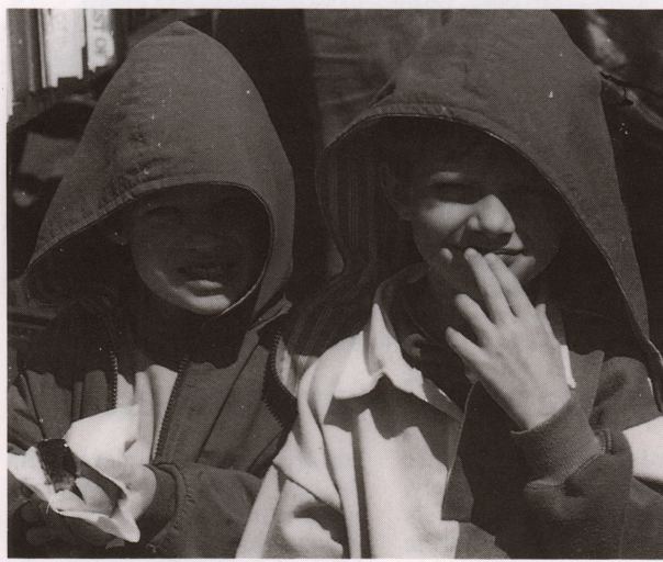
Don't look now but I think we're being photographed