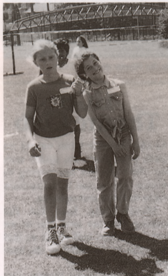
The Fun Run at Brookland School