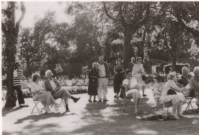
Relaxing in the sunshine watching Scottish country dancing