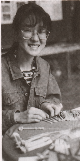
Bobbin lace making at the Institute