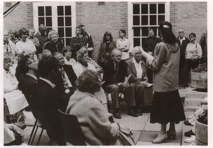
The Mayor opens the Weekend before the Garden Suburb Theatre enact Henrietta's difficulties in getting her dream realised