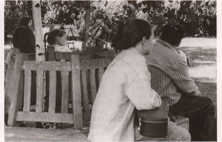
Youth Music Centre players perform by the Tony Mandelson memorial seat on Willifield Green