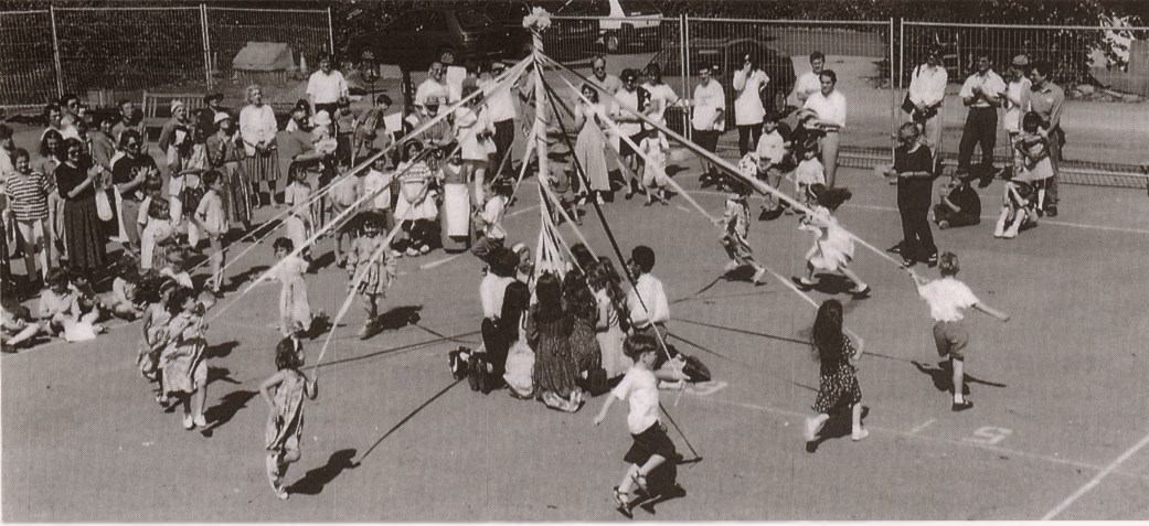
Garden Suburb and Brookland schools put on dancing displays at Childs Way