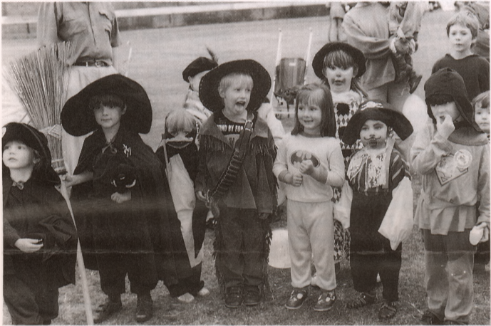
Hot competition for the best fancy dress