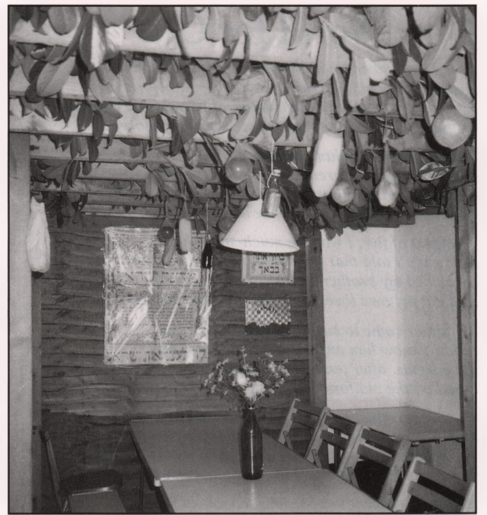
A typical 'booth' (Succah) in the Suburb where the family have all their meals for the 7 days of the Festival of Tabernacles. The partitions are stored all year and, when erected for the Festival, the walls are decorated with posters and the roof is layered with laurel leaves.

"For 7 days ye shall dwell in booths to remember when I brought you forth from the Land of Egypt" Leviticus 23:43