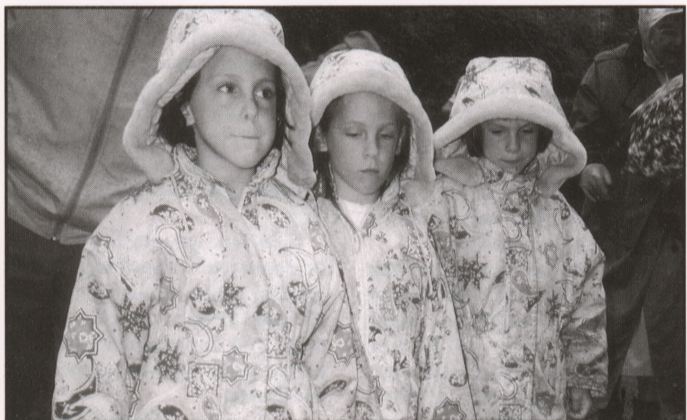
Three little girls in the rain