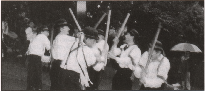
Courageous Morris dancers