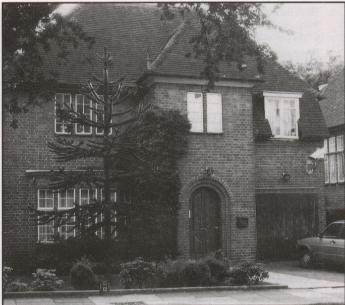
92 Kingsley Way

Whenever leaflets advertising double glazing are circulated to Suburb residents the Trust sends a recorded delivery letter to the company explaining that before windows can be changed the prior approval of both the Trust and Barnet is required. So far letters have been sent to companies such as: Denverglaze, Zenith Windows, Weatherglaze, and Anglian Windows. Suburb residents still need to be on their guard since the standard contract for the supply of double glazing often has a clause saying that it is the responsibility of the owner to get the necessary approvals. In two recent cases owners with properties in the Market Place and Rowan Walk, who had unauthorised double glazing installed, were faced with the unenviable choice of being sued by the double glazing company for the non-payment of their invoice or face enforcement action by the Trust and Barnet for installing illegal windows.