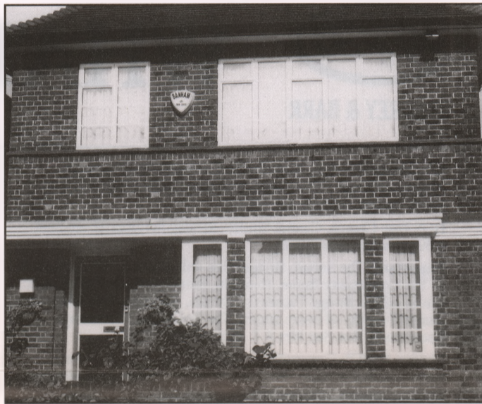
4 Devon Rise