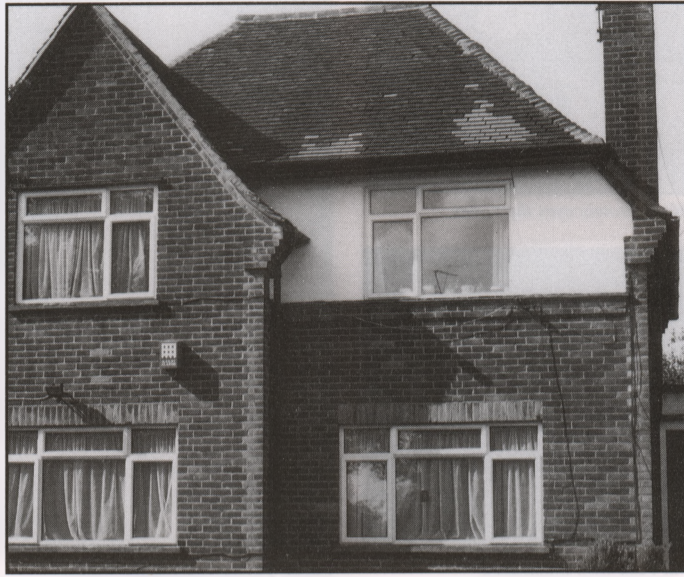
37 Brim Hill

In a new Design Guideline to be published shortly by the Trust and Barnet both organisations confirm that when Suburb windows need replacing the original design and materials should be used. In other words integral double glazing units made of either UPVC or aluminium are unacceptable. If double glazing is required then the secondary type should be used, which consist of separate glass panes on the inside. It is considered that windows made of UPVC and aluminium cannot be an exact replica of the original.