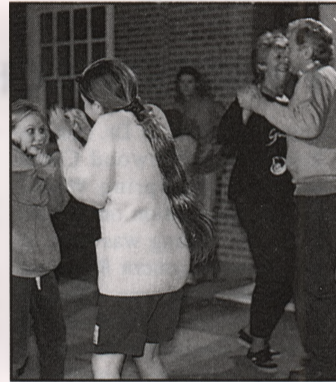
. . . . two dance styles