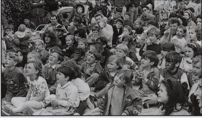
Punch and Judy always popular