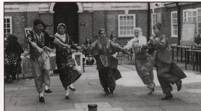
Turkish dancing by Institute students