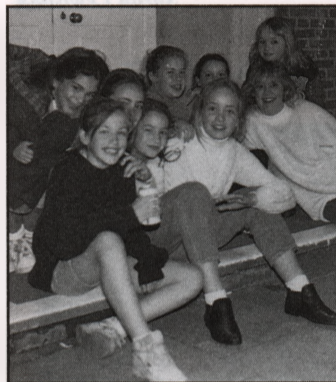
Just listening . . . .