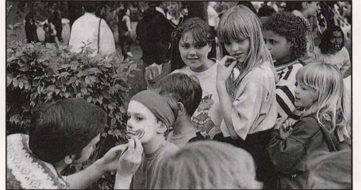
Face painting at the FHA Fete on the Square