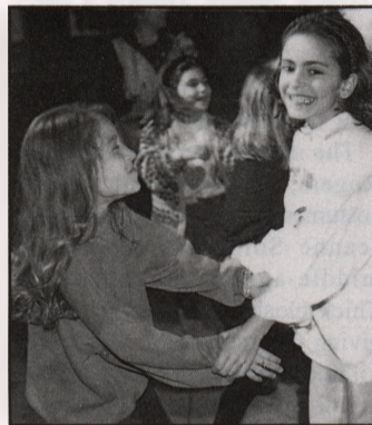
. . . . on the Square