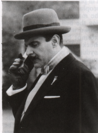
David Suchet using a distinctly out of period telephone.