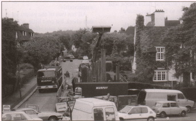
Above: Massive works at the Hampstead Way Meadway Junction where 18' deep shafts are being dug prior to tunneling under Meadway.