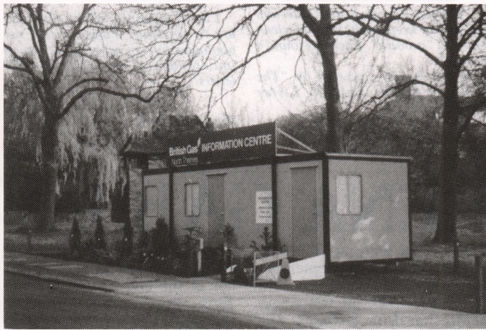
The British Gas 'Lego' hut complete with 'garden' but not on the phone.