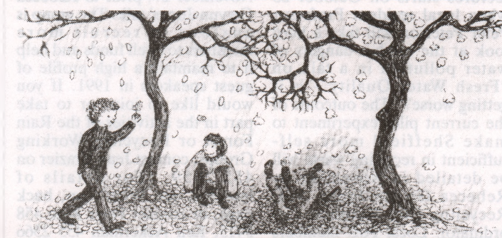
AUTUMN ON OSSULTON WAY

Whenever I walk down Ossulton Way On a chilly autumn day,