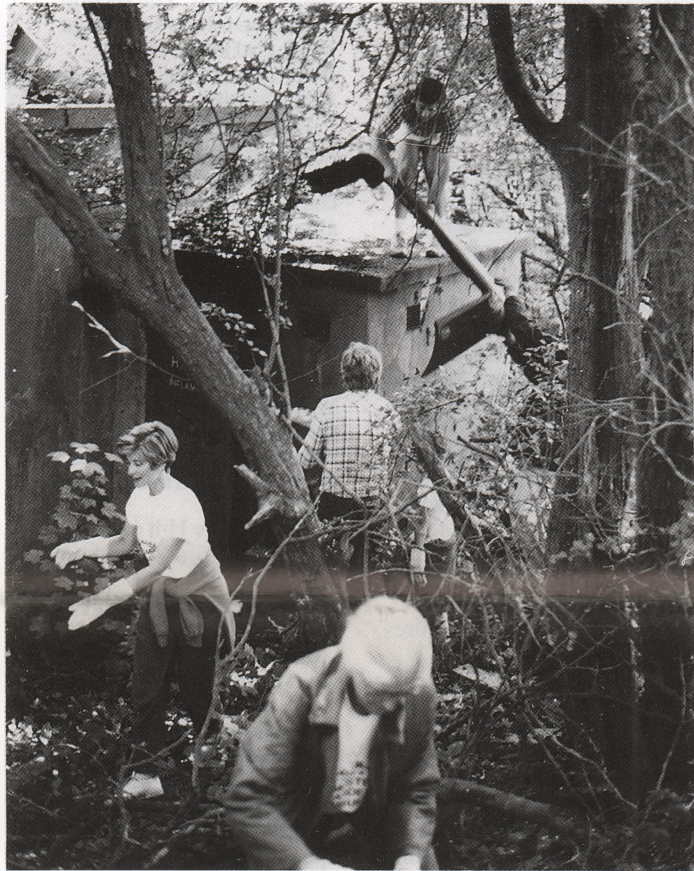
The big Bigwood Clean-up brought out lots of residents and several skips-full of junk.