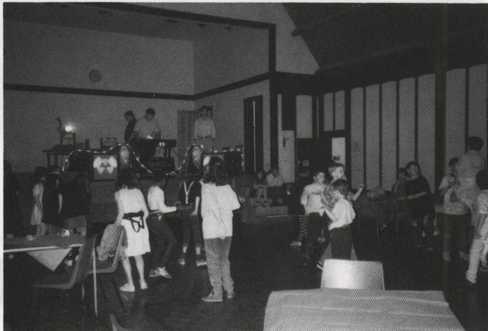
Catalyst Youth Club disco.