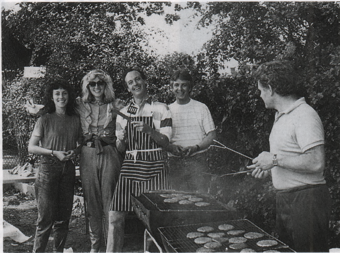
Smoked helpers at the barbecue.