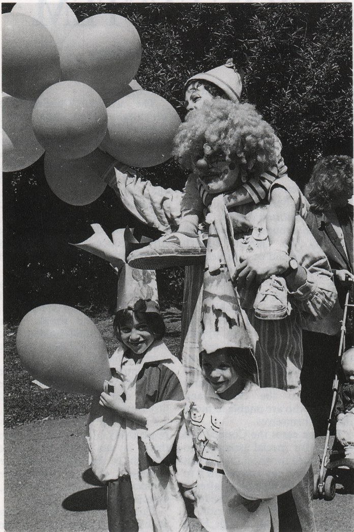
Clowns and clowning were the order of the day.