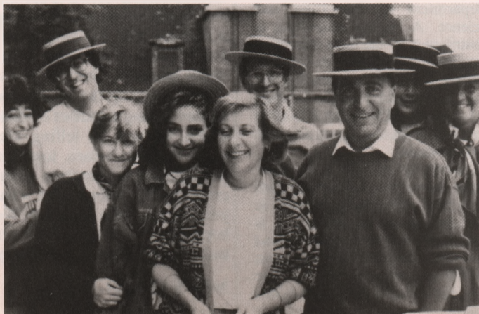
JWB team organised the balloon race.