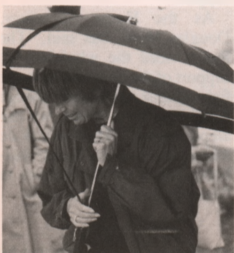
JWB team organised the balloon race.

Umbrellas were perhaps the most conspicuous feature of the Family Fete organised by the Residents Association on September 6th.