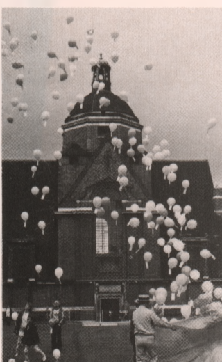
Balloon race goes up.