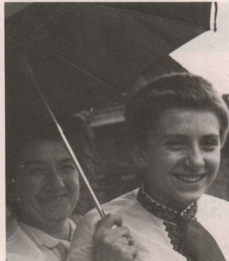
Ukrainian dancer shelters too.