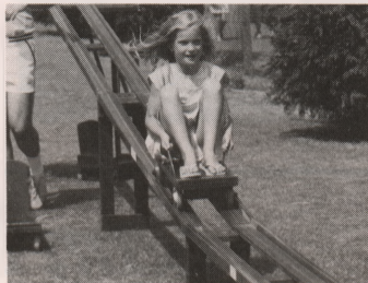
The 'little' big dipper.