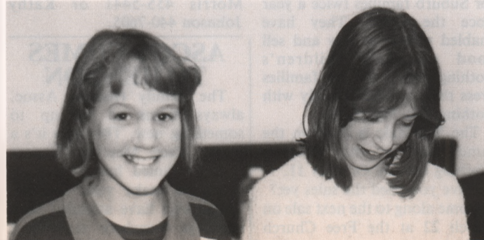
The Youth Club did the catering.