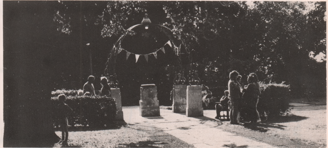
The Fete made the Square a meeting place for friends and neighbours late into the afternoon.