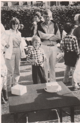
Quoits for the FHA.