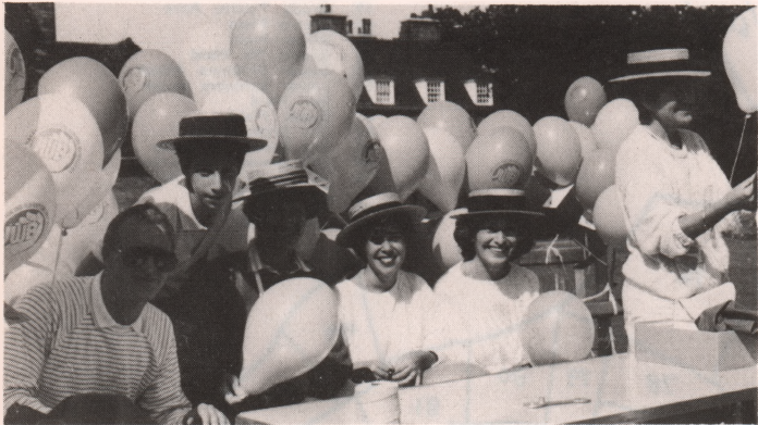
Jewish Welfare Board's balloon race.