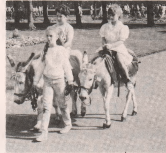
Popular donkey rides