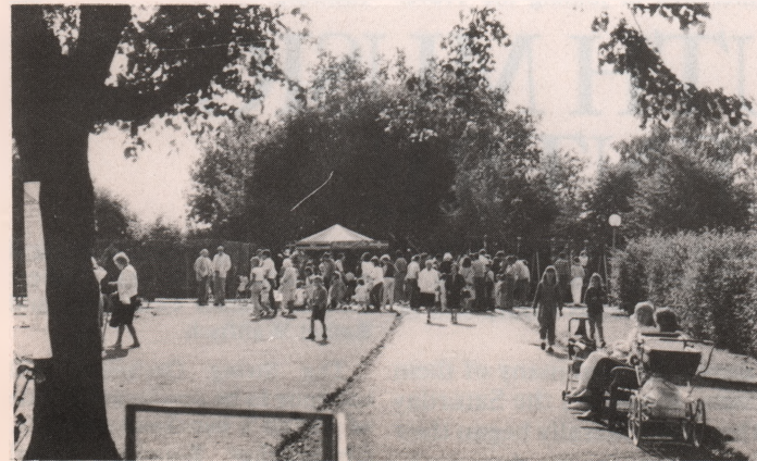
The RA was lucky with the weather.