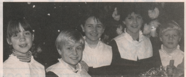
Some of the junior choir