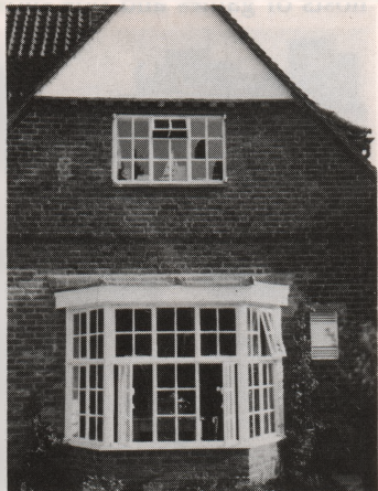
Garage into living room.