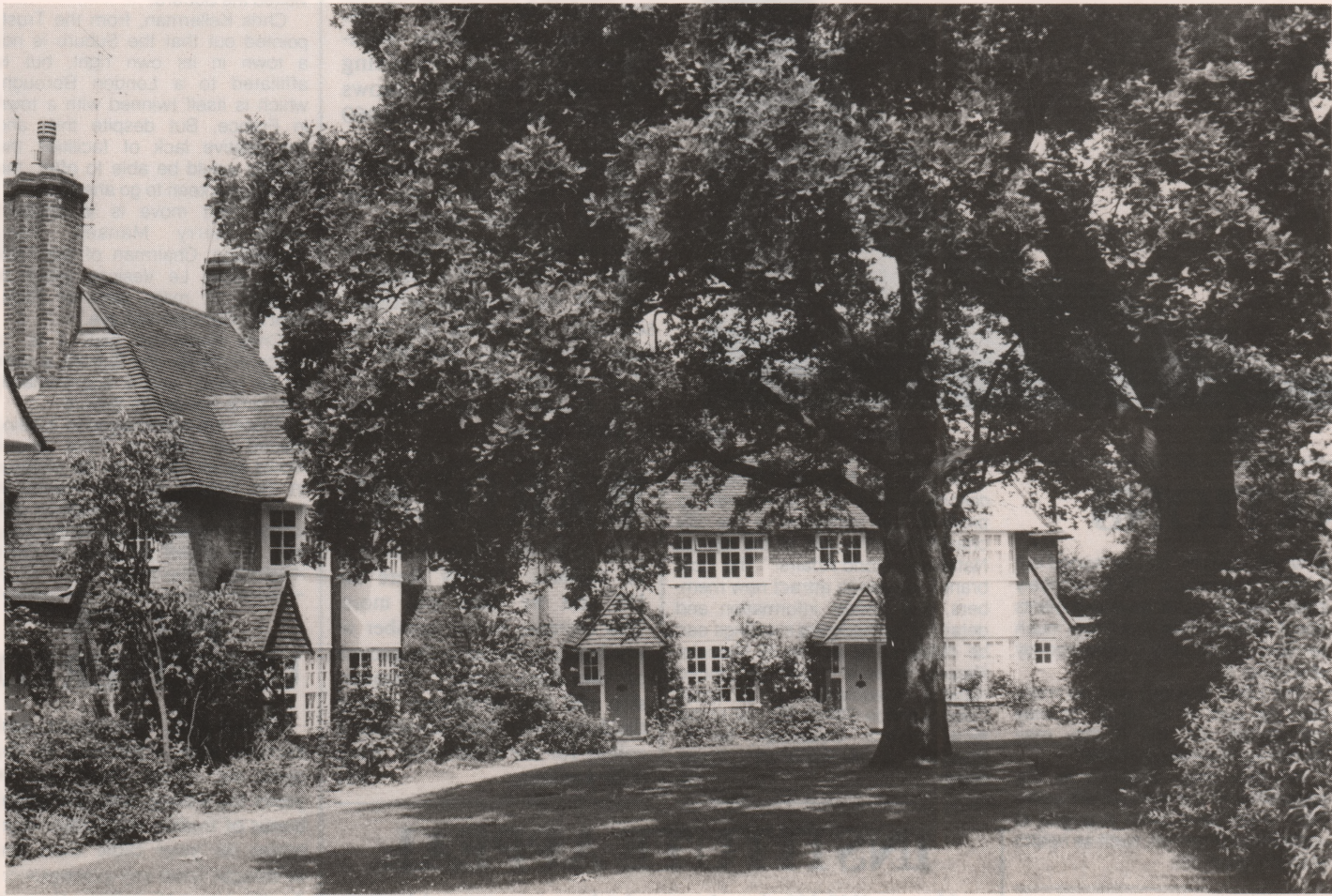
Part of Lucas Crescent, Willifield Way.

The Minister, Mrs Lynda Chalker, has "bitten on the bullet" and selected the Yellow (Tidal Flow) Scheme to try and press through a Public Inquiry. It is now up to the whole Suburb community to make sure she does not succeed. The Trust,