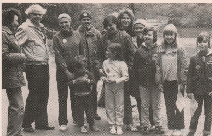
Some of the Suburb contingent, who walked many miles for Christian Aid, about to set off from Kenwood.

... and the HGSCC played Barnes on Lyttleton Playing Fields.