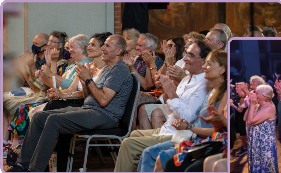
Our fabulous Proms 2025 audience