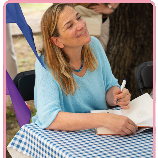
▼ Tracy Chevalier