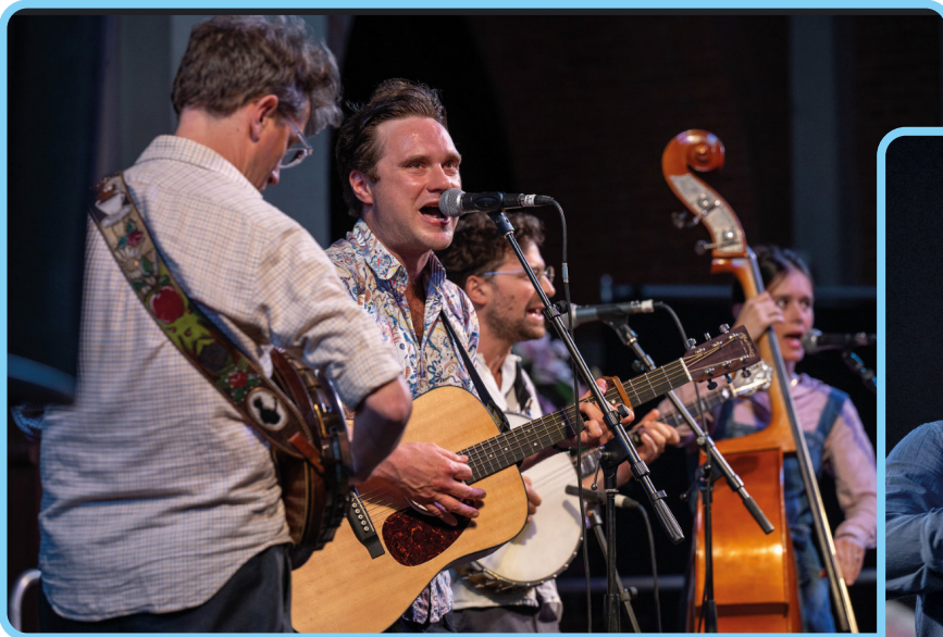
◀ The Thumping Tommys