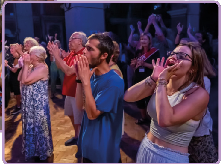
Audience members enjoy Fleetwood Mac's Rumours