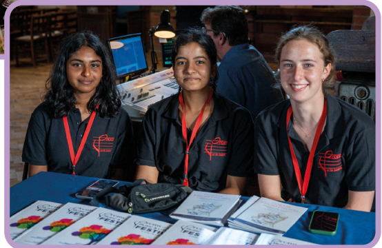
Our wonderful volunteer crew