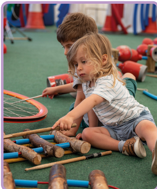
Children enjoying Junk Orchestra