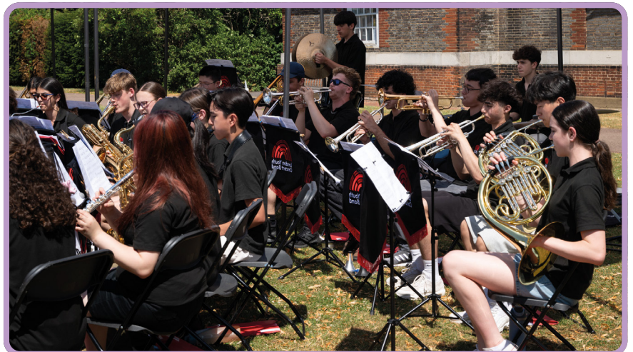
The London Youth Concert Band