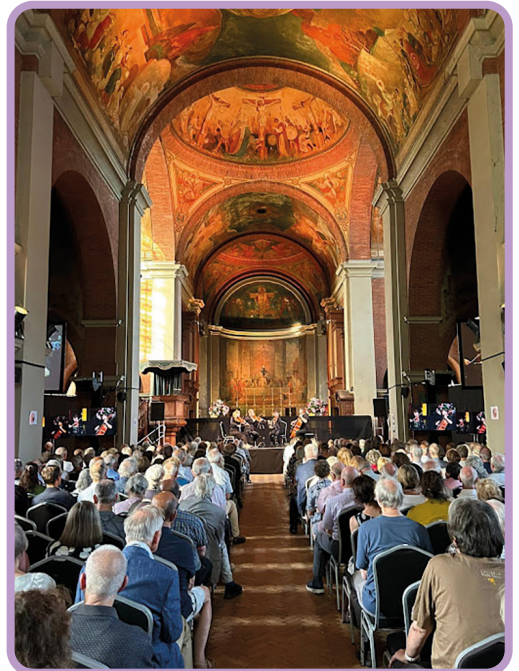
An eager audience for Fibonacci Quartet ▼ 'An Italian Carnival'