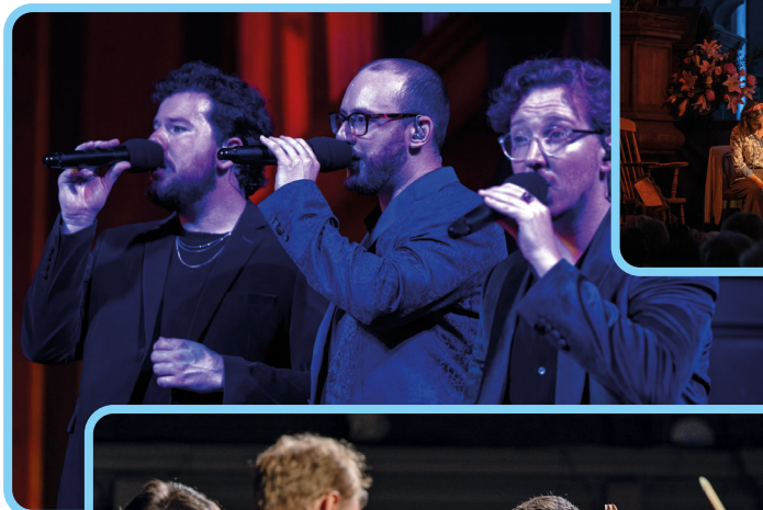
◀ The Swingles Live!