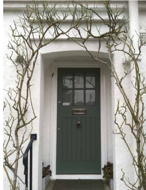
Rosa New Dawn, January 2020 BEFORE

And then there's technique. Always controversial this one. Some experts swear that you can just take the hedge trimmer to modern bush roses, cutting down to knee height, but I think that's clumsy and not nearly so much fun. (I love