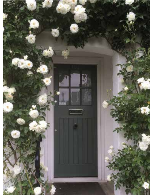
Rosa New Dawn, Summer 2020 AFTER

pruning roses, you see, I don't get out much!) There's talk of achieving a bowl shape, tulip shape, cup shape, which means there should be no stems in the middle. Dead stems can be cut away any time and don't leave a stump, it'll only rot and encourage disease. Then cut away thin, wispy stems. You want to end up with a framework of about five pencil thick stems. Cut out any crossing stems means this: if you've got one stem pointing outwards and another