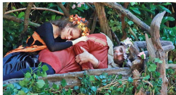
Last year's summer production in Little Oak Wood of A Midsummer Night's Dream.