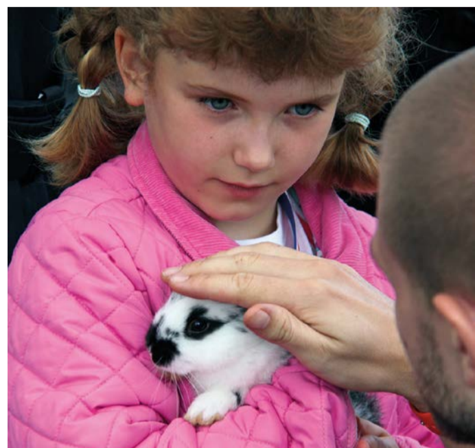
"Be careful, be very careful..." Protective instincts on display at last year's RA Summer Picnic. Details of this year's Summer Picnic on back page.