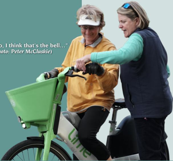
"No, I think that's the bell..."