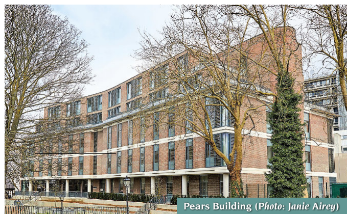
Pears Building