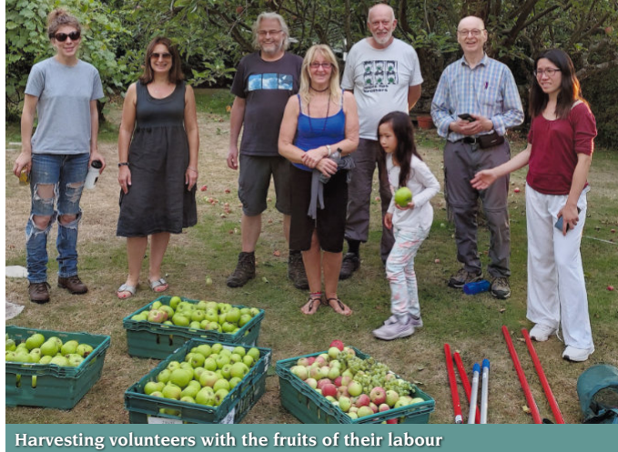
Harvesting volunteers with the fruits of their labour