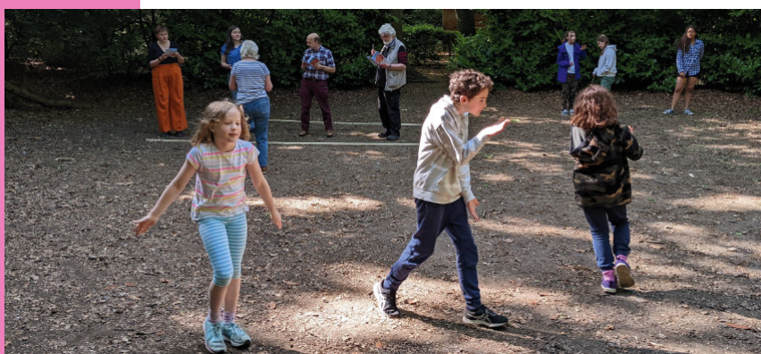
James and the Giant Peach rehearsals

Tickets and details are now available at www.promsatstjudes.co.uk and in a leaflet available in libraries and supermarkets in Temple Fortune.