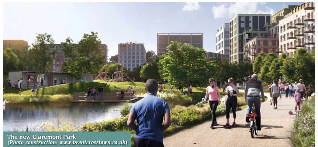
The new Claremont Park