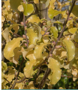
Pittosporum Warnham Gold