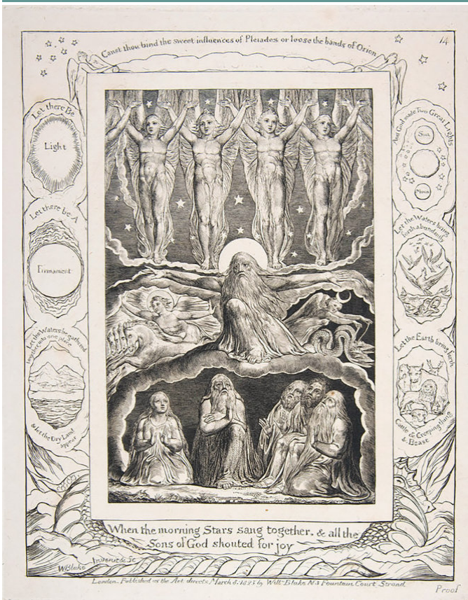
Illustration from 'The Book of Job' by William Blake. Plate 14, When the Morning Stars Sang Together

In 1906, Raymond Unwin moved in to Wyldes Farm, a year after Henrietta Barnett commissioned him to plan the new garden suburb in association with Edwin Landseer Lutyens, thus establishing Wyldes Farm (now known as Old Wyldes) with a connection to the Suburb.