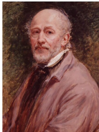
John Linnell by John Linnell (detail), circa 1860

The house survived through the years, with some modifications and, in 1824, it was rented to John Linnell a painter who originally had a thriving portrait practice. Linnell is now mainly known as a painter of 'typical uneventful English lands' rich in poetic feeling and glowing in colour. His paintings made him one of the nineteenth century wealthiest landscape artists. The blue plaque commemorating Linnell also mentions William Blake stayed with him as his guest. Despite the difference in age (Linnell was 26 and Blake 61 when they first met) there was an immediate affinity between the two men. Both considered that the natural world was a reflection of the spiritual world. They were also both proud of their working-class origins and