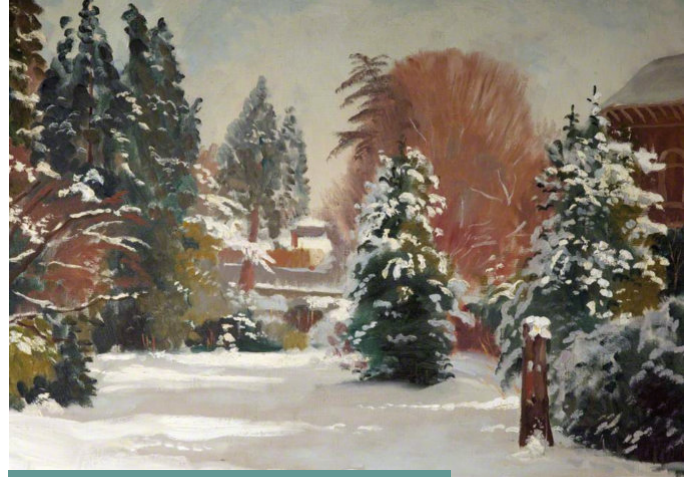
Garden under Snow, John Whitlock Codner