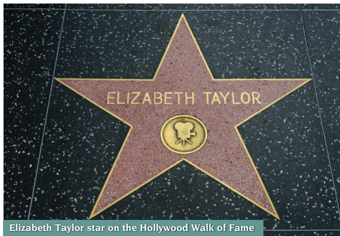
Elizabeth Taylor star on the Hollywood Walk of Fame