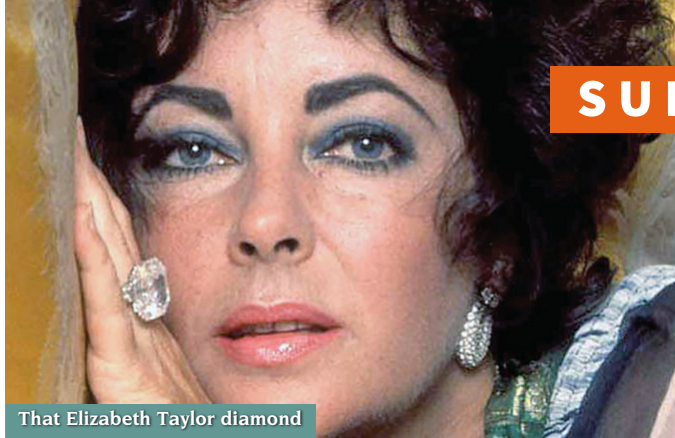
That Elizabeth Taylor diamond

Elizabeth Taylor died on the 23rd of March 2011. Ever true to her lifelong reputation she arranged to be fifteen minutes late for her own funeral.