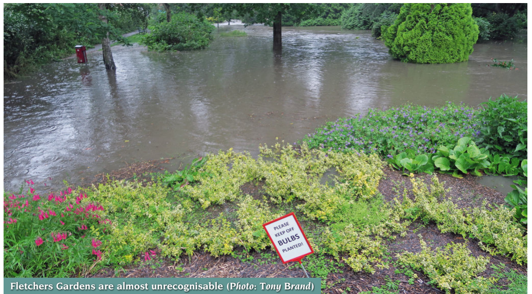
Fletchers Gardens are almost unrecognisable