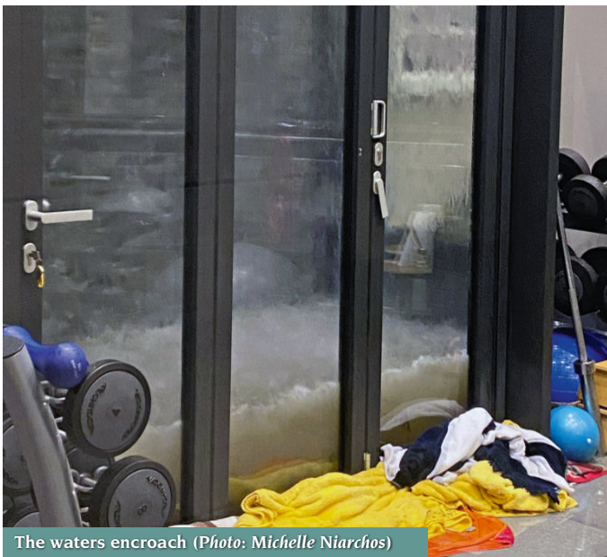
The waters encroach

Weeks later we are continuing to see the after effects of the flooding, an example being the loss of one of the beautiful old willows in Northway Gardens (see photos below).