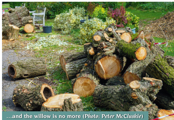
...and the willow is no more