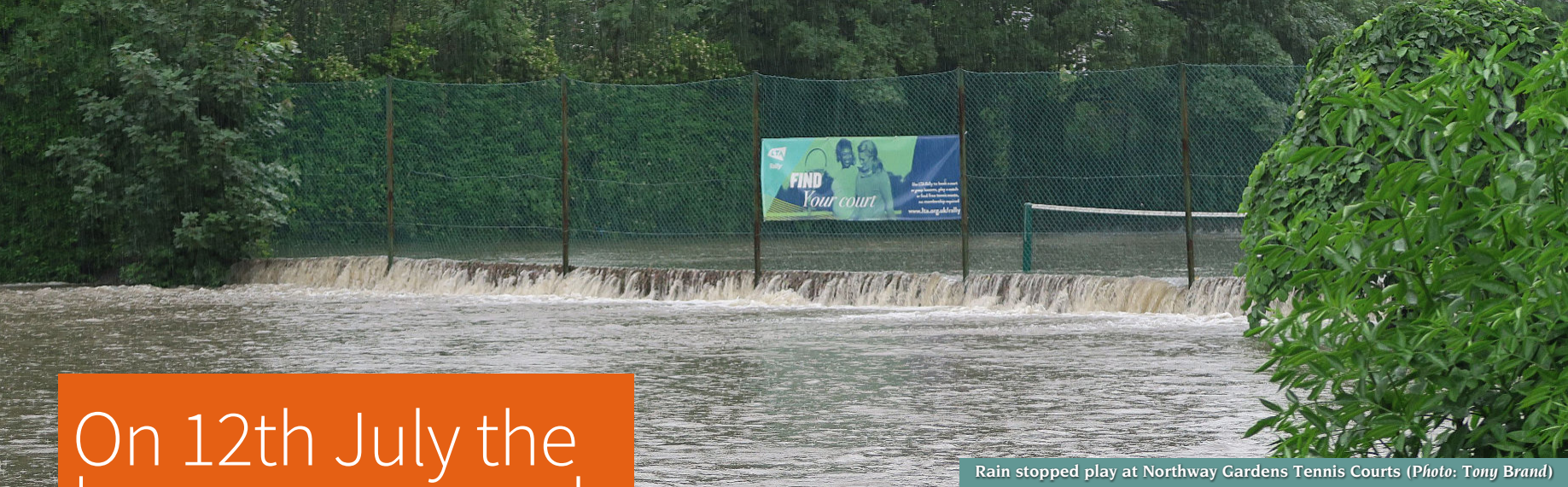
Rain stopped play at Northway Gardens Tennis Courts