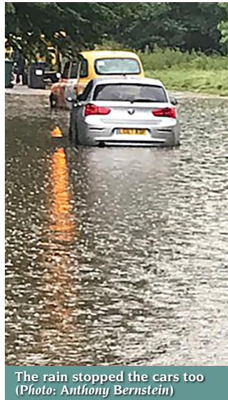
The rain stopped the cars too