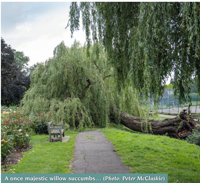
A once majestic willow succumbs...