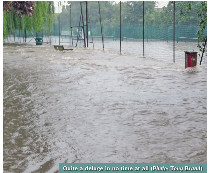
Quite a deluge in no time at all