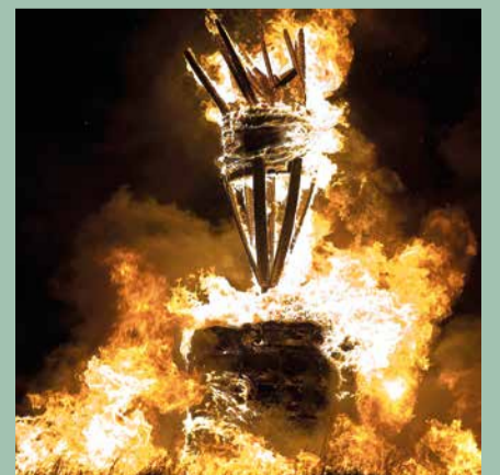
The Burning of the Clavie which is an old Pagan Festival, held in the coastal village of Burghead, Moray, Scotland, that celebrates the New Year on 11 January 2020.