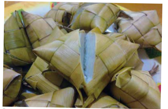
Popular festival food is street food, for example puso (hanging packages of rice wrapped in leaves). Cebu City is also famed for its barbecue.

With a complex cultural history and an uncertain future, at their core, these festivals still bring together families and communities to celebrate their heritage and beliefs. Perhaps this reminds us of what our own festivals mean to us - that festive spirit that bonds together family, friends and strangers: all are welcome.