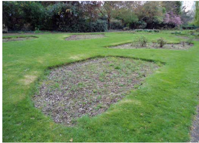
Northway Rose Gardens – before (above) and after (below).

can support us by going to JustGiving hgs rose gardens. Or you can send a cheque to Northway Gardens Organisation c/o 69 Brookland Rise, NW11 6DT.