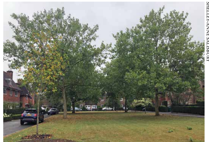
Saved plane trees in Turner Close.