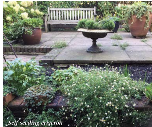
Self seeding erigeron

Whilst many of these self-sown residents are welcomed with open arms, others claim squatters' rights. Spanish bluebells and wild garlic can choke a garden if left unchecked. You've got to admire their tenacity, spreading themselves by seed and bulb, so deeply embedded that only monotonous and judicious digging will shift them.