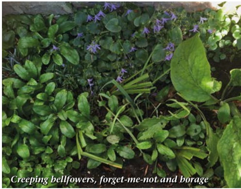
Creeping bellflowers, forget-me-not and borage

I wonder sometimes, is it the same robin that follows me around The Suburb as I work from garden to garden? The plants certainly do! Do the birds transfer forget-me-not and Welsh poppy or is it, in fact, me?