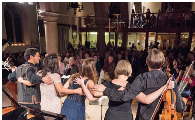
Part of the 2018 Highgate International Chamber Music Festival

The festival will continue their unique, integrated Young Artists scheme this year, which helps emerging ensembles to develop