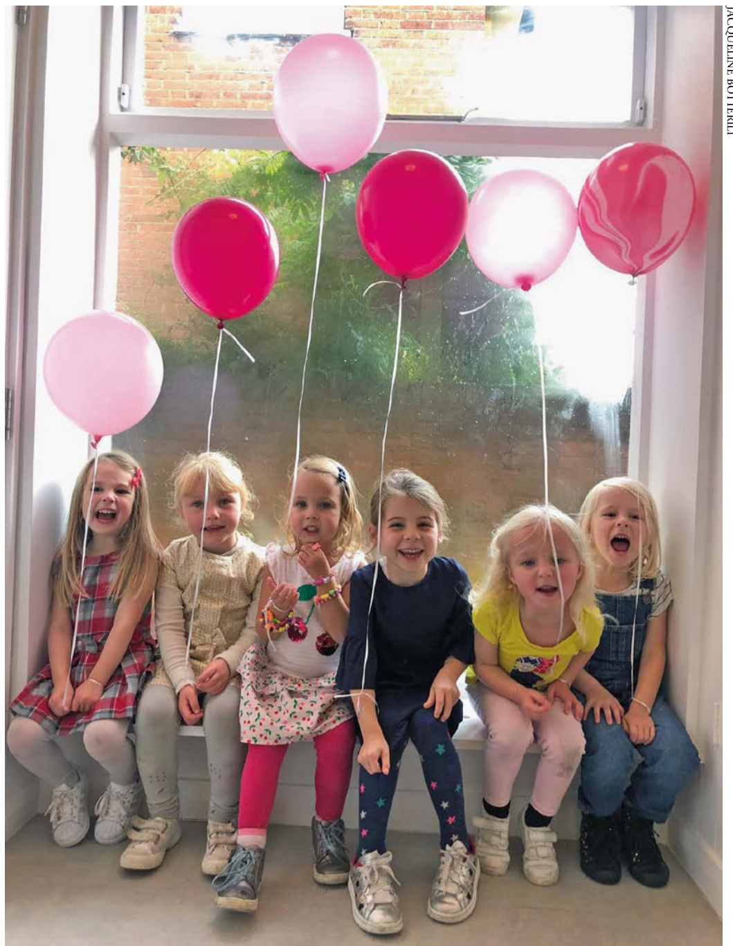
Not just for oldies – A photo of 'The Ladies of Fellowship' shows some younger Suburb residents enjoying themselves at a recent Fellowship children's party.