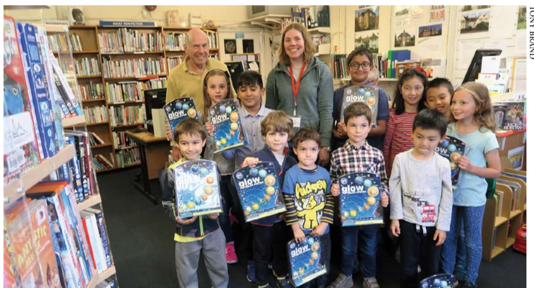
Summer Reading Challenge 2019 This takes place every year during the summer holidays. You can sign up at your local library, then read six library books of your choice to complete the Challenge. Congratulations to all the children who completed the HGS Summer Reading Challenge this year and won a prize! For other ideas check the website: summerreadingchallenge.org.uk .

Tickets are available at www.chambermusicfestival.co.uk . Under its 'Kids Go Free!' initiative, any paying adult may bring up to two children (16 & under) with them free of charge.