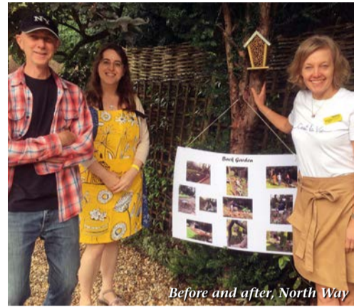
Before and after, North Way