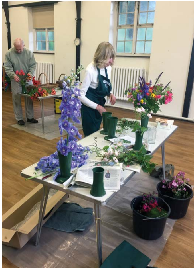
Summer Flower Show preparations