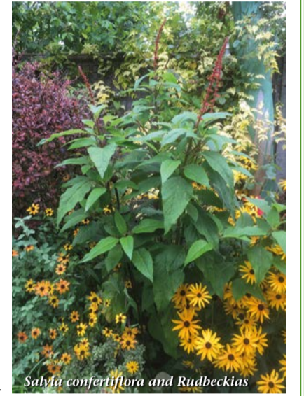
Salvia confertiflora and Rudbeckias