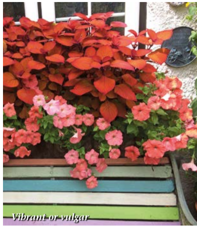
Vibrant or vulgar

Have you ever wondered why purple is the new black, last year's kitten heels have conceded to this year's flat pumps? It's Fashion my dears, Fashion! Is it