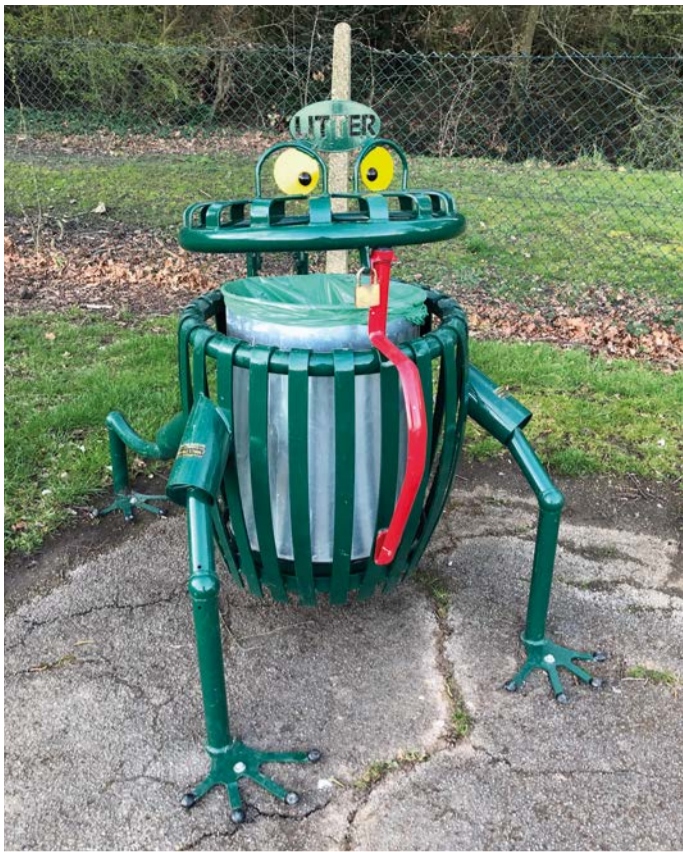
PLAYFUL LITTER BIN Thank you to LB Barnet for removing the old bins in the playground at Lyttelton and replacing them with new ones. This is the first to arrive and it looks very handsome indeed.