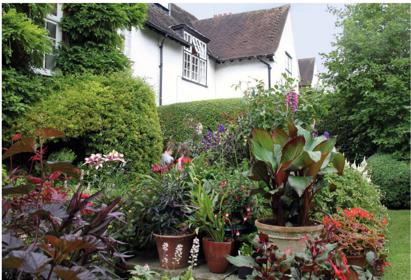
The Secret Garden of two small hideaways at 84 Oakwood Road, that's soon to become an Open Garden on Sunday July 7. See article on page 11.