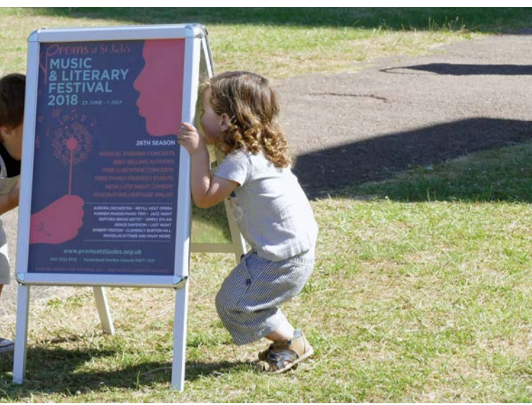
An insider look at this year's Proms