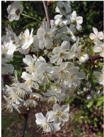
Wild cherry blossom