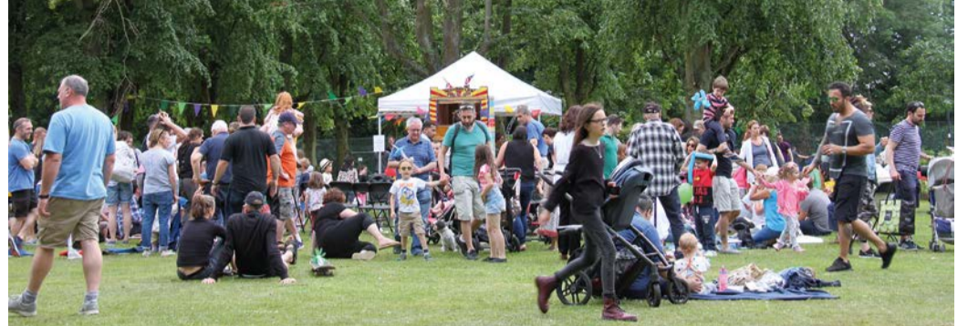
Last year's Summer Fun Day

An exciting display of cars will be hosted by Volvo Cars North London who have kindly agreed to sponsor our event. Picnic tables are available to book now for £17 for a table and 6 chairs. With promises of a good summer, we hope to see many of you on Central Square to enjoy the festivities.