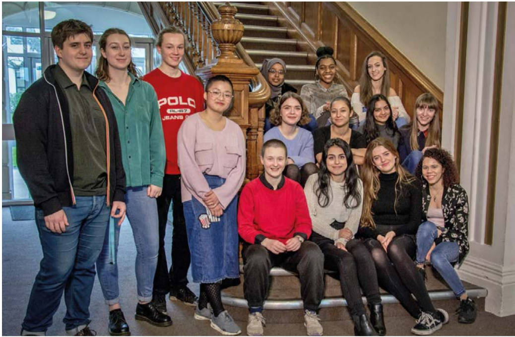
Most of the hard-working Woodhouse eighteen

Woodhouse College near Tally Ho Corner had both a record number of Oxbridge interviews this year with 57, and a record number of offers of places. 18 students were offered places in colleges at Oxford and Cambridge Universities in January this year.